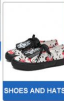
SHOES AND HATS